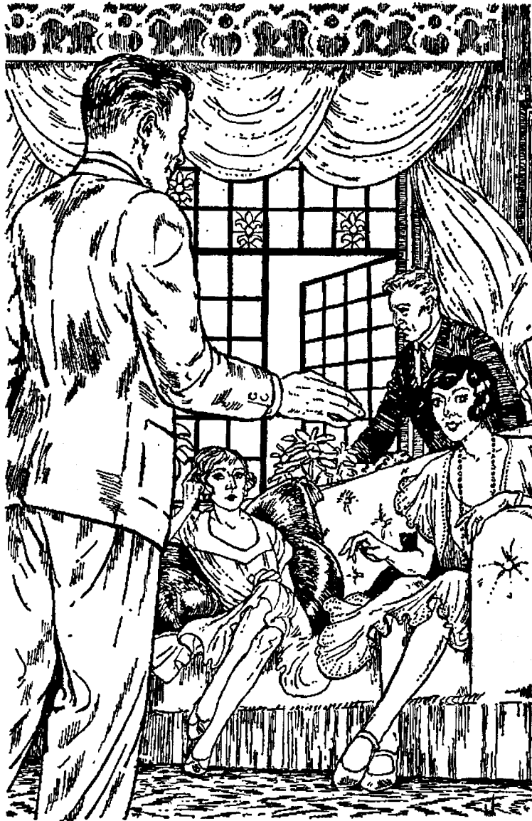
Two young women were sitting on an enormous couch.

slim, with grey eyes and a pale, unhappy face. I was sure I had seen her before.