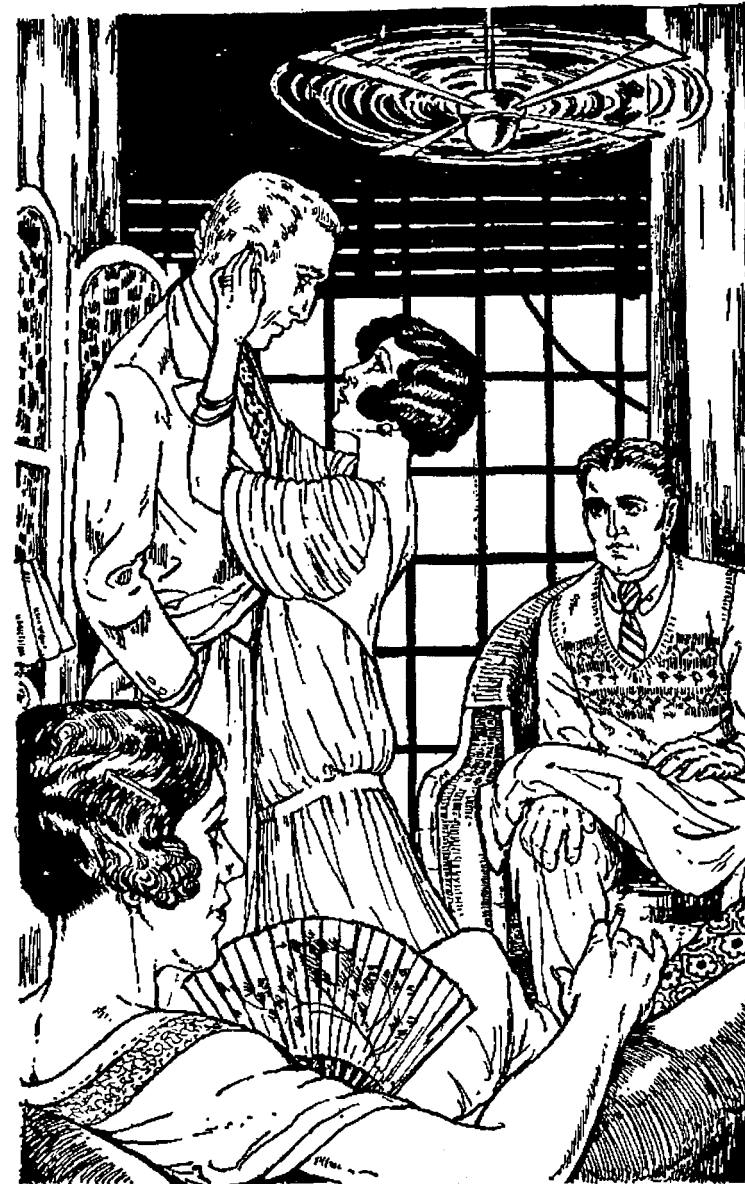
'You know I love you,' she said softly.

Suddenly, Tom Buchanan understood. His wife, Daisy,