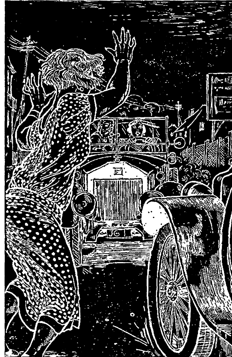
'That woman rushed into the road just as a car was coming the other way.'

'Daisy wouldn't stop,' Gatsby explained. 'Then she felt faint and I drove home. I'm waiting here now in case Tom makes any trouble.'