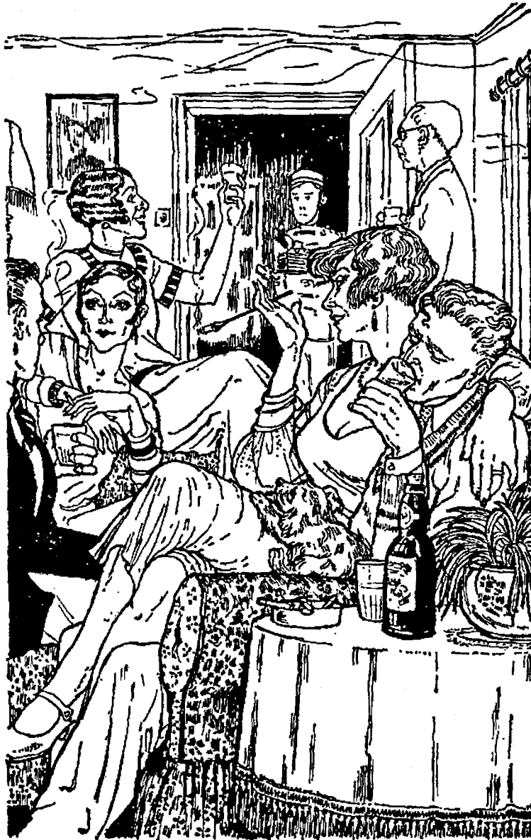
The room was fitted with Myrtle's loud, fake laughter.

lay on the couch. Her nose was still bleeding and she was crying loudly.