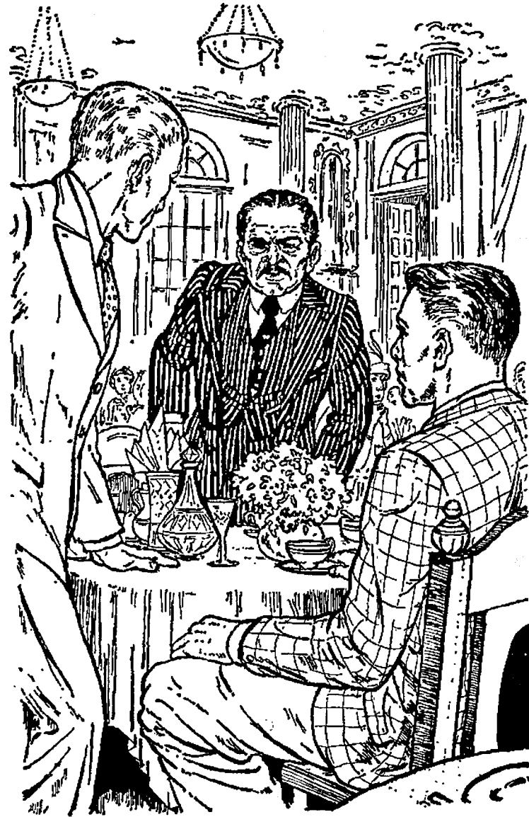
When Gatsby came back to our table, Mr Wolfsheim got to his feet and looked round the room.

'This is Mr Gatsby, Mr Buchanan,' I said.