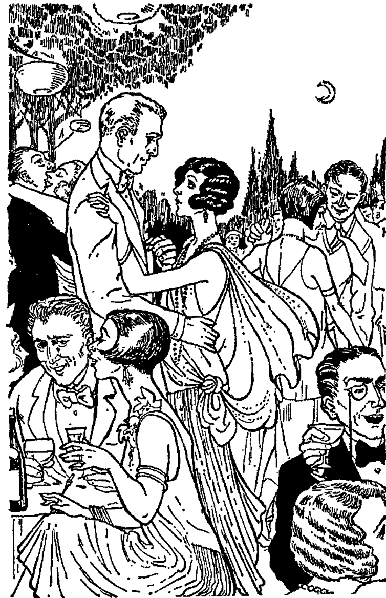
Daisy and Gatsby danced together.

As they got into their car, Daisy looked back at the house