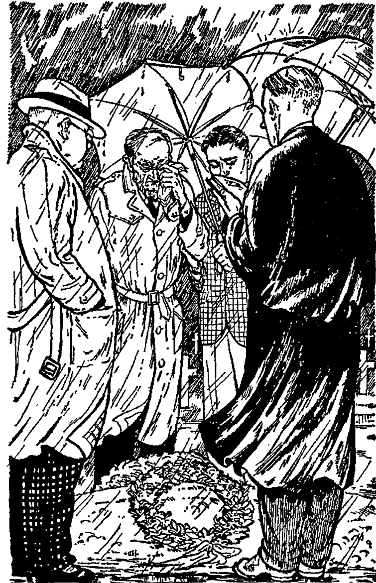
As we stood by the grave, I saw that Daisy hadn't sent a flower or a message.

After the funeral, the fat man said, 'I'm sorry I couldn't get to the house.'