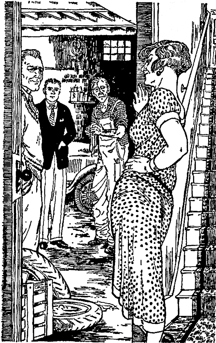
I heard footsteps on the stairs. Then a woman was standing in the doorway.

'I want one of those dogs,' Mrs Wilson said. 'It will be nice to have one in the apartment' 19 . What kind are they?' she asked the man. 'I want a police dog.'